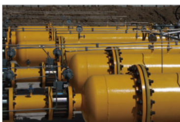
▲ Municipal Engineering & Utilities