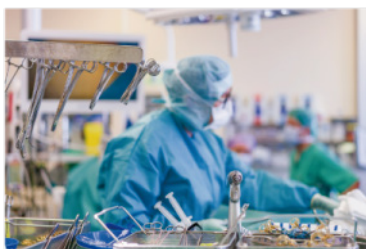
▲ Food & Pharmaceutical Industry