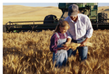
▲ Agricultural & Environmental Protection