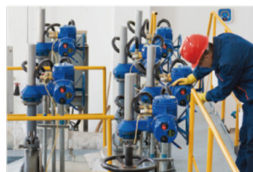
▲ Other Industries